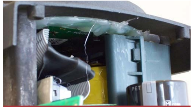
Imitators use, what looks like, big globs of hot glue to secure components.