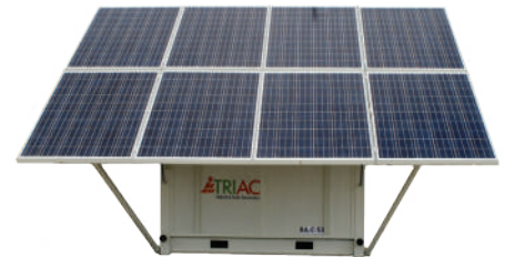
TRIAC Front View