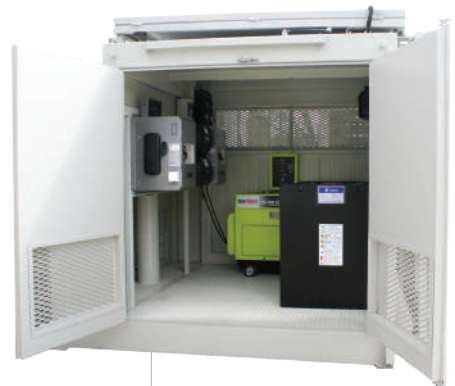
OutBack FLEXware Series on Left