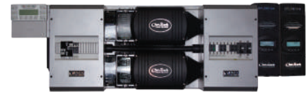
OutBack FLEXware 500