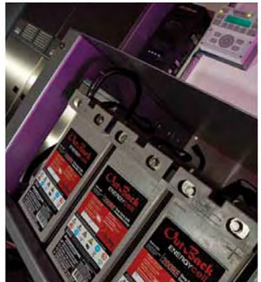
OutBack's Radian Series inverter/charger support both standard and advanced energy storage platforms.