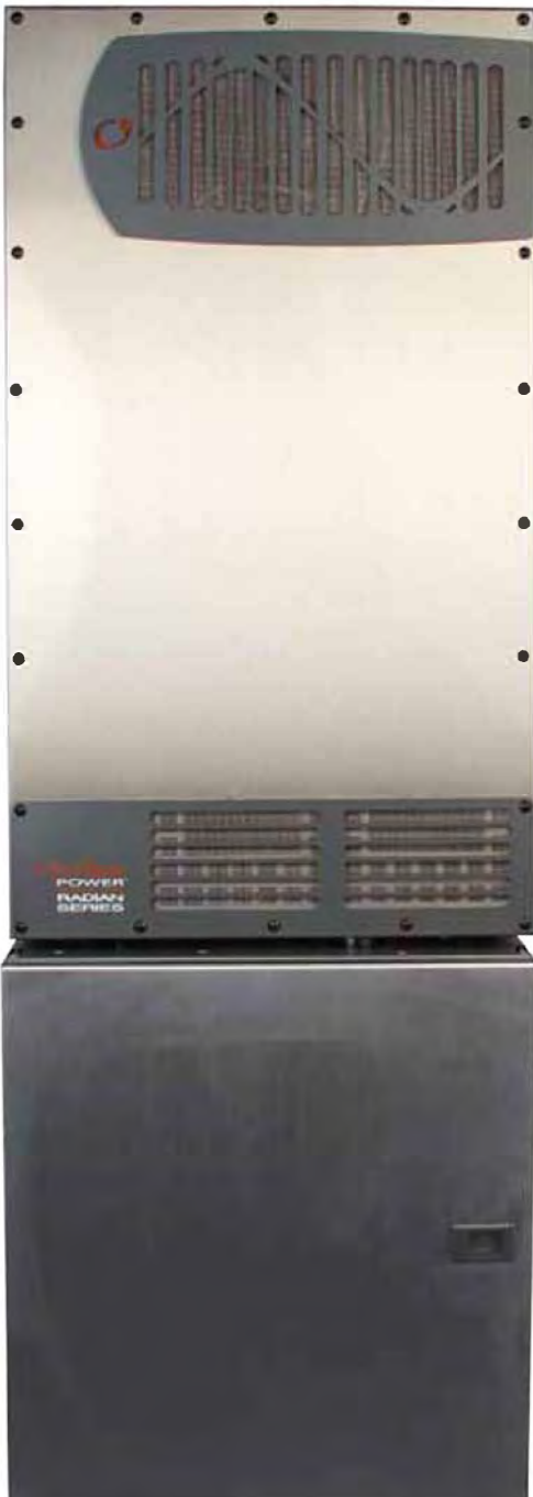
Radian Series Inverter/Charger with GS Load Center

With all the hallmark features you've come to expect from the Radian inverter/charger , the expanded Radian family includes four models, seven operating modes and two advanced technologies , all adding up to unmatched performance, reliability, value and system flexibility.